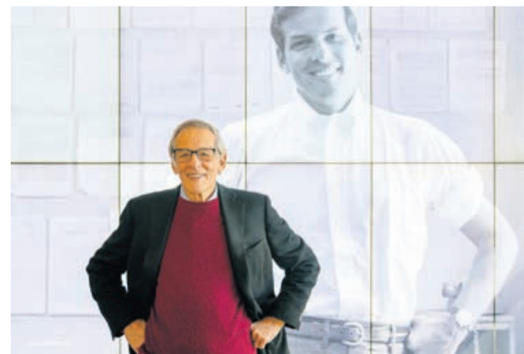
Author and biographer Robert Caro stands beside an image of his younger self after touring a permanent exhibit in his honor, "Turn Every Page": Inside the Robert A. Caro Archive, at the New York Historical Society Museum & Library in New York on Oct. 20, 2021.

troops to the Dominican Republic in 1965 to prevent a feared communist takeover. □